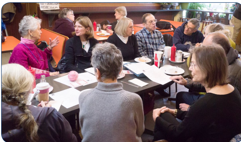
Brunch Bunch at Olympia Café