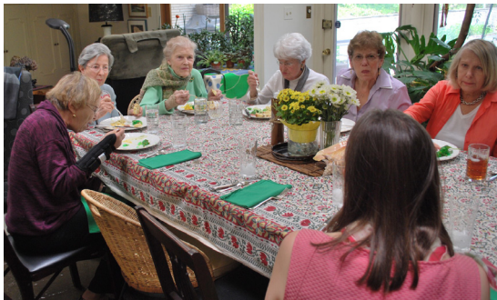
Social Networking & Program Committee at luncheon gathering

The list contains the names of companies and individuals who provide home repair or enhancement services and other service-oriented businesses but does not include providers of professional personal services (physicians, dentists, in-home health services, etc.). For those who are not comfortable working with the list on the computer, the office will still provide suggestions upon request by telephone or e-mail.