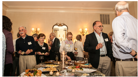
Volunteer Appreciation Event