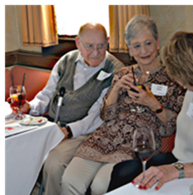
A Relaxing Moment At The 10 th Anniversary Celebration